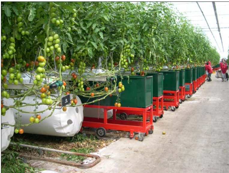
Figure 1. Themato near Bleiswijk (Netherlands) is the pioneer of the Closed Greenhouse. After successful small-scale trials they expanded to 14,000 m 2 closed greenhouse, and are now a demonstration site. Initial crops were tomatoes, but in 2006 they grow capsicum on all 14,000 m 2 . See text for results.

Acknowledgements: many people should be credited, and many sources quoted. I've tried to include the most significant names in the article.